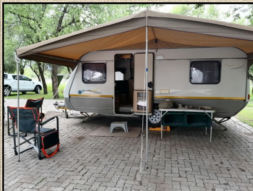
Allan & Trudie set- ting up camp.