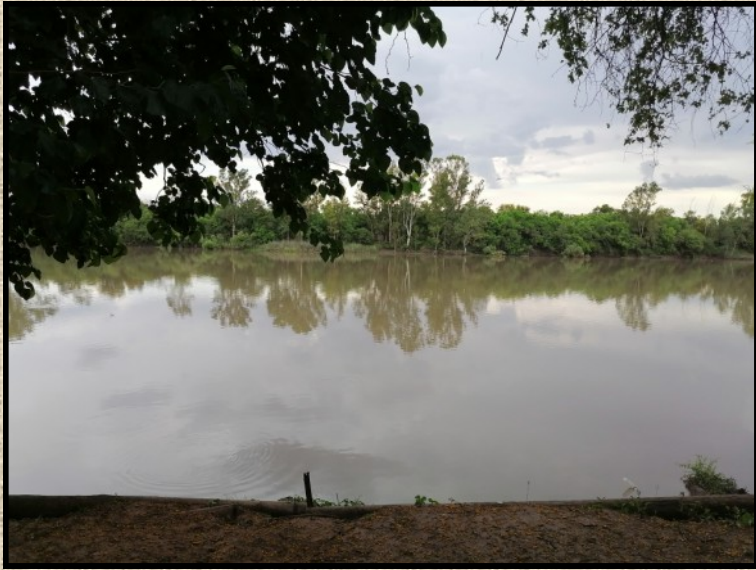
The view from the camping sites of the Vaal River.

10 - 12 December 2021 Andries's 60 th Birthday Orkney. North West Province.