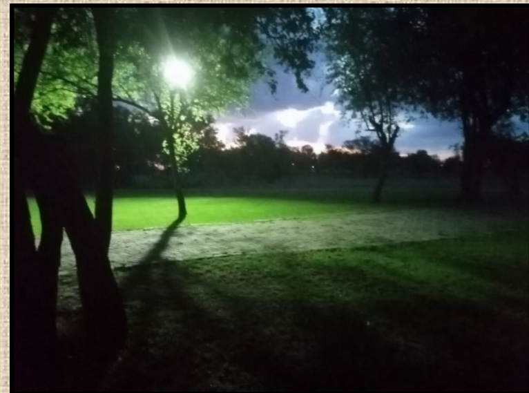
Evening approaching over the Campsite