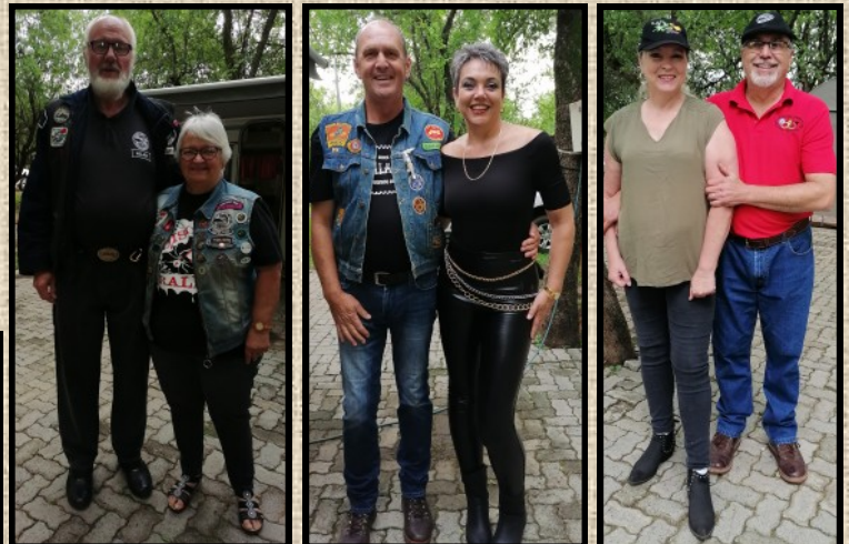
Dressed for the Theme - Denim & Black or Leathers