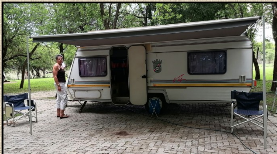
Gerald & Beatrix setting up camp.

10 - 12 December 2021 Andries's 60 th Birthday Orkney. North West Province.