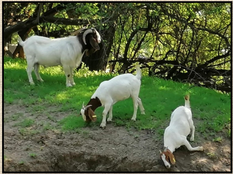
Campsite Lawn Mowers.