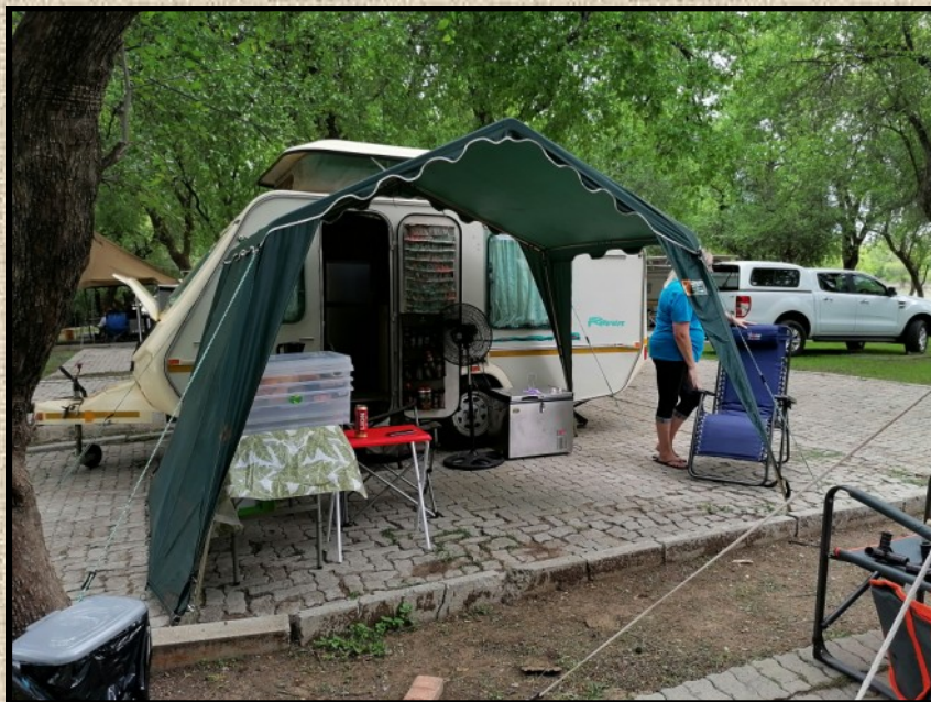
Nicky & Valerie set- ting up camp.