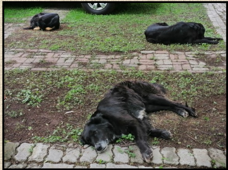
The Campsite's 3 watch dogs.